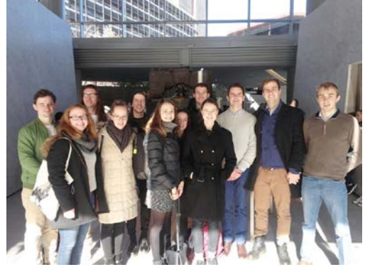
A visit to the Liberty Bell in Philadelphia – a day-trip assisted by the National Park Service along Independence Mall.