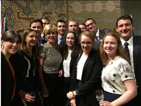
A brief visit with Australia's Foreign Minister Julie Bishop during a cultural exhibition opening and reception at the Australian Embassy.