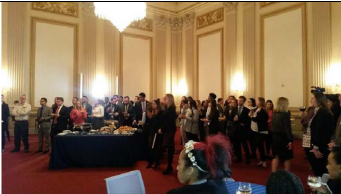
... as the gathering looked on.